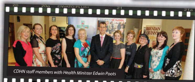
CDHN staff members with Health Minister Edwin Poots

Welcome to "Lite Bite", a newsletter brought to you by the Community Development and Health Network (CDHN) through its Building the Community-Pharmacy Partnership (BCPP) Programme . In this issue we continue to convey the message of BCPP through stories from our BCPP projects. We are showcasing coverage of our 10 year celebration and are delighted that the event, endorsed by Minister Poots, was such a success. We hope this edition gives you an insight into BCPP projects at work and information on new rounds of funding. Remember, CDHN are here to help you develop your ideas into community-pharmacy partnership projects that will work to meet local needs using a community development approach. If you require support or have any comments or suggestions, please contact us.